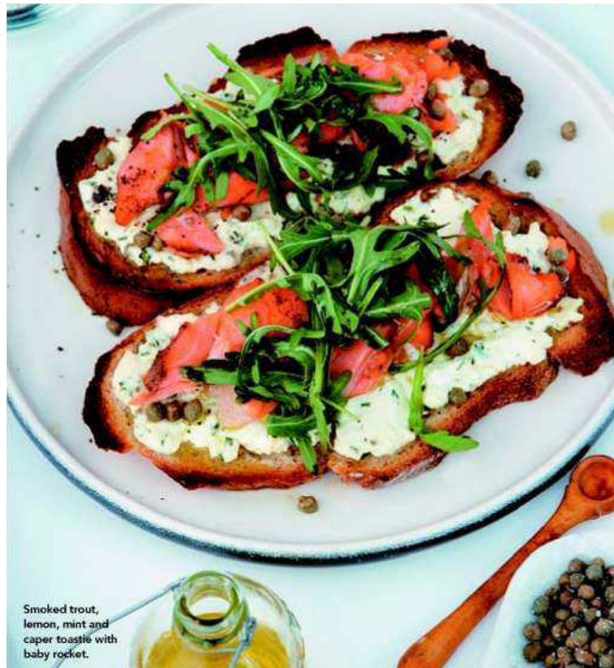
Smoked trout, lemon, mint and caper toastie with baby rocket.

alexandriacheese.com.au barossacheese.com.au islandpure.com.au lacasa.com.au woodlidescheese.com.au