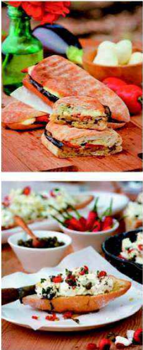
THE KITCHEN TOASTIES

To assemble sandwich When the baguette is lightly toasted, rub it with the whole garlic clove. Then carefully remove chevre from oven and spread the hot chevre mixture onto the baguette. Season with fresh oregano and remaining sliced chilli, and drizzle with a little more olive oil before serving.