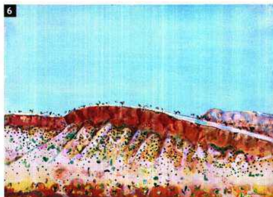
1/ The Great Victorian Bike Ride. 2/ Jennifer Cochrane's Pyramid Stack from last year's Sculpture by the Sea exhibition in Bondi. 3/ Jeffrey Smart's Truck and Trailer Approaching a City, on show at the Art Gallery of Ballarat's Australian Modern Masterpieces exhibition (courtesy Art Gallery of NSW). 4/ Margaret Olley's Portrait in the Mirror 1948, also on show at The Art Gallery of Ballarat (courtesy Art Gallery of NSW). 5/ Hiromi Tango is performing at the MCA's Primavera Festival. Insanity Magnet 2009. Image courtesy of the artist; photograph by Yuki Nakanol. 6/ Hammersley Landscape, from the Fred Williams: Infinite Horizons exhibition at the NGA. Courtesy of the estate of Fred Williams.

November 11-12 Bushman skills such as bull riding are on show in this celebration of Australia's pastoral heritage. Cunnamulla is at the crossroads of the Matilda Highway and Adventure Way. paroo.info/CunnamullaFellaFestival.aspx